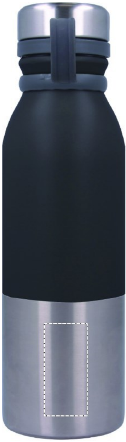
4. BACK LOWER