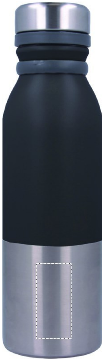
2. FRONT LOWER