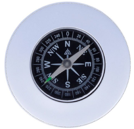
3. LASER COMPASS