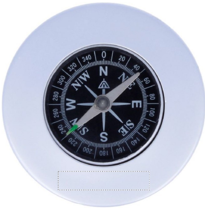
1. TOP COMPASS