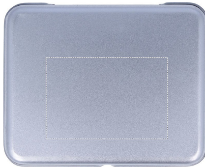
2. TOP BOX